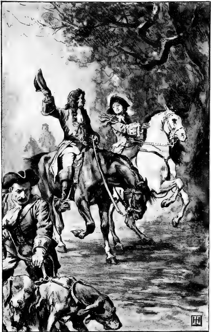
"Caressing her horse with one hand." (Page 35.)